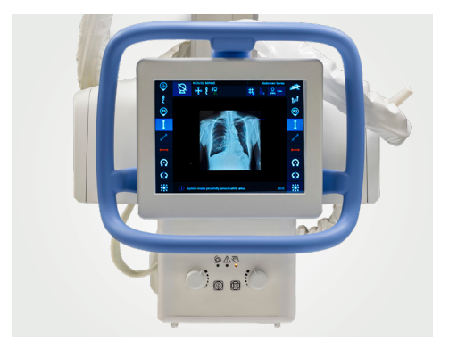
State-of-the-art imaging software supports detailed bone and soft tissue visualization.